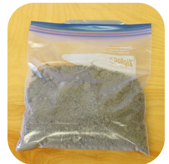
Figure 3. Soil sample ready for shipping.

When in doubt on how to sample – check the lab’s directions for sampling and submission, they usually provide them online.