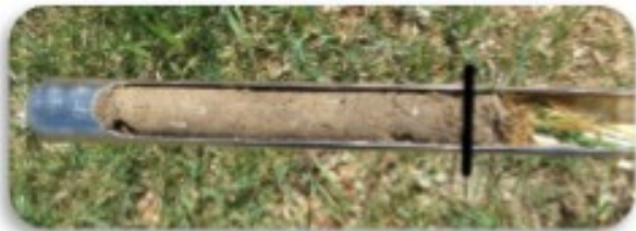
Figure 1. Soil sample core, discard portion to the right of the black line.